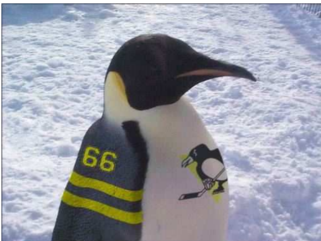
Star Goalie For the Pittsburgh Penguins